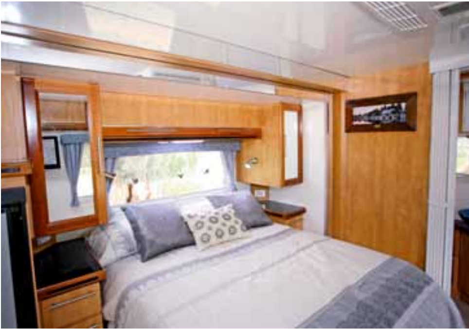
From top: With its 5250kg GVM, a light rigid licence is required; curtain for bathroom privacy; the east-west bed fills the rear of the slide-out.

and passenger seats swivel around and, together with a removable table and the side lounge, make for a neat little dining/lounging area.