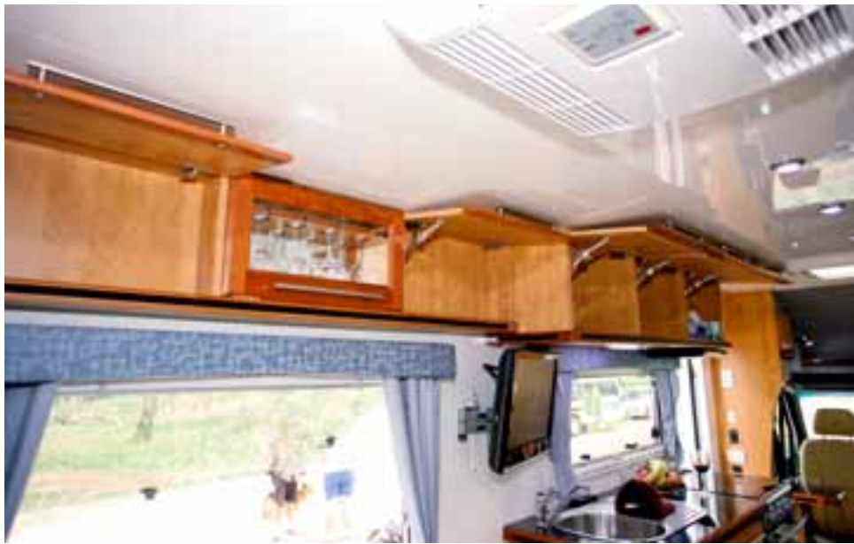
Top: Kitchen may seem small, but ticks all necessary boxes. Above: Swivel driver's seat incorporates nicely with the lounge/dinette.