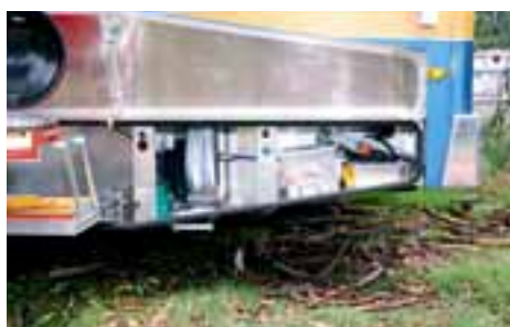
Top: Al fresco cooking is a breeze. Above right: Impressive external storage, though access is difficult when the slide-out is open.

panel (and accompanying EC325 power supply) controls all of the above items, as well as security lighting, event timing and automatic filling of the drinking water tank. Just set and forget. Lighting throughout is comprised of energy-efficient LEDs.